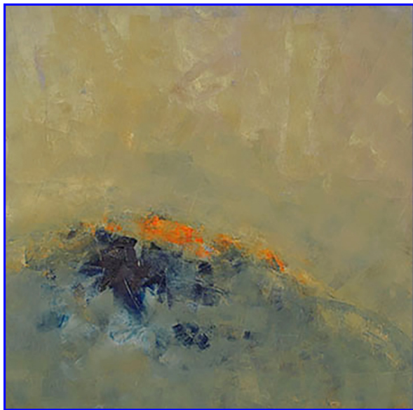
Reverie, oil, cold wax on board

One and Five Linwood Avenue, Buffalo, NY.