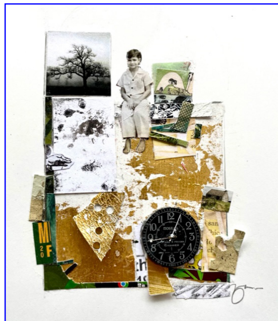
Waiting , collage and liquid charcoal

269 Amherst St., Buffalo https://www.facebook.com/thephoenixat269/ 716.259.9271 Check location for hours.