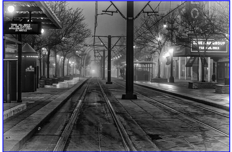
On Main Street, photograph

Your consideration of others is appreciated when visiting the gallery.