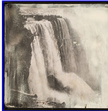
Doreen Cutting, Terrapin Rock , mixed media on wood