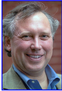
by William Altreuter

Building on a legacy since 1891, we embrace visual exploration as critical to the voice of our time.