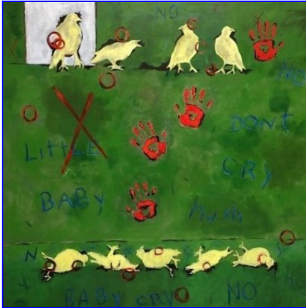
The End of Imagination, acrylic