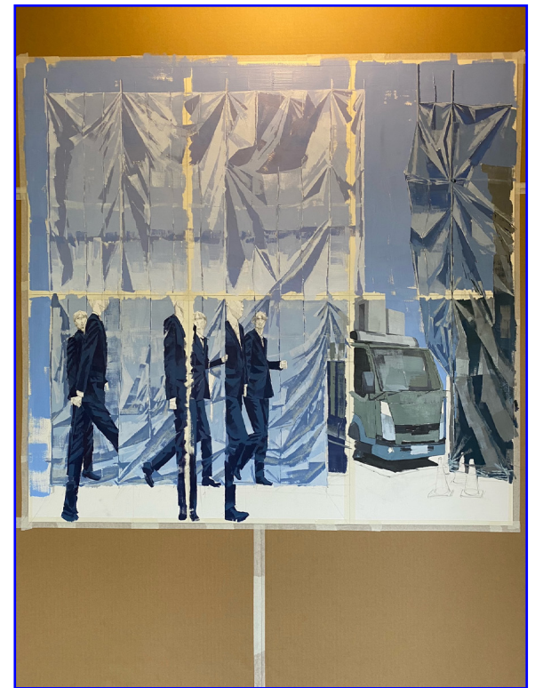
acrylics on hot-pressed Arches watercolor paper

https://www.facebook.com/wildthingsbuffalo/