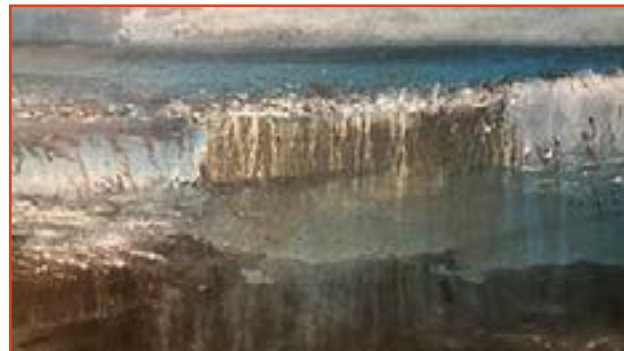
Breach , acrylic on burlap