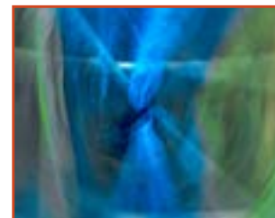
Undercurrent , archival pigment print, Ann Peterson