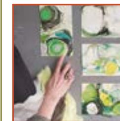
Marbling series, Anahata