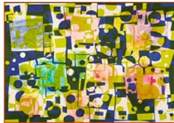
Yes...And , woodblock monoprint