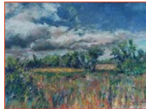
Bennington Farm , pastel on sanded paper